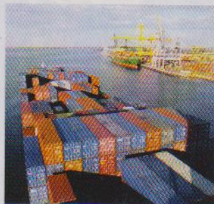
Australia's Dutch disease The consequences of the commodity boom, page 63